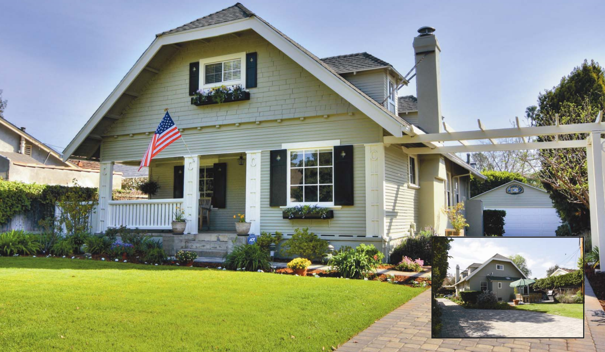
Charming Craftsman in Prime Madison Heights 662 S El Molino Avenue | Pasadena