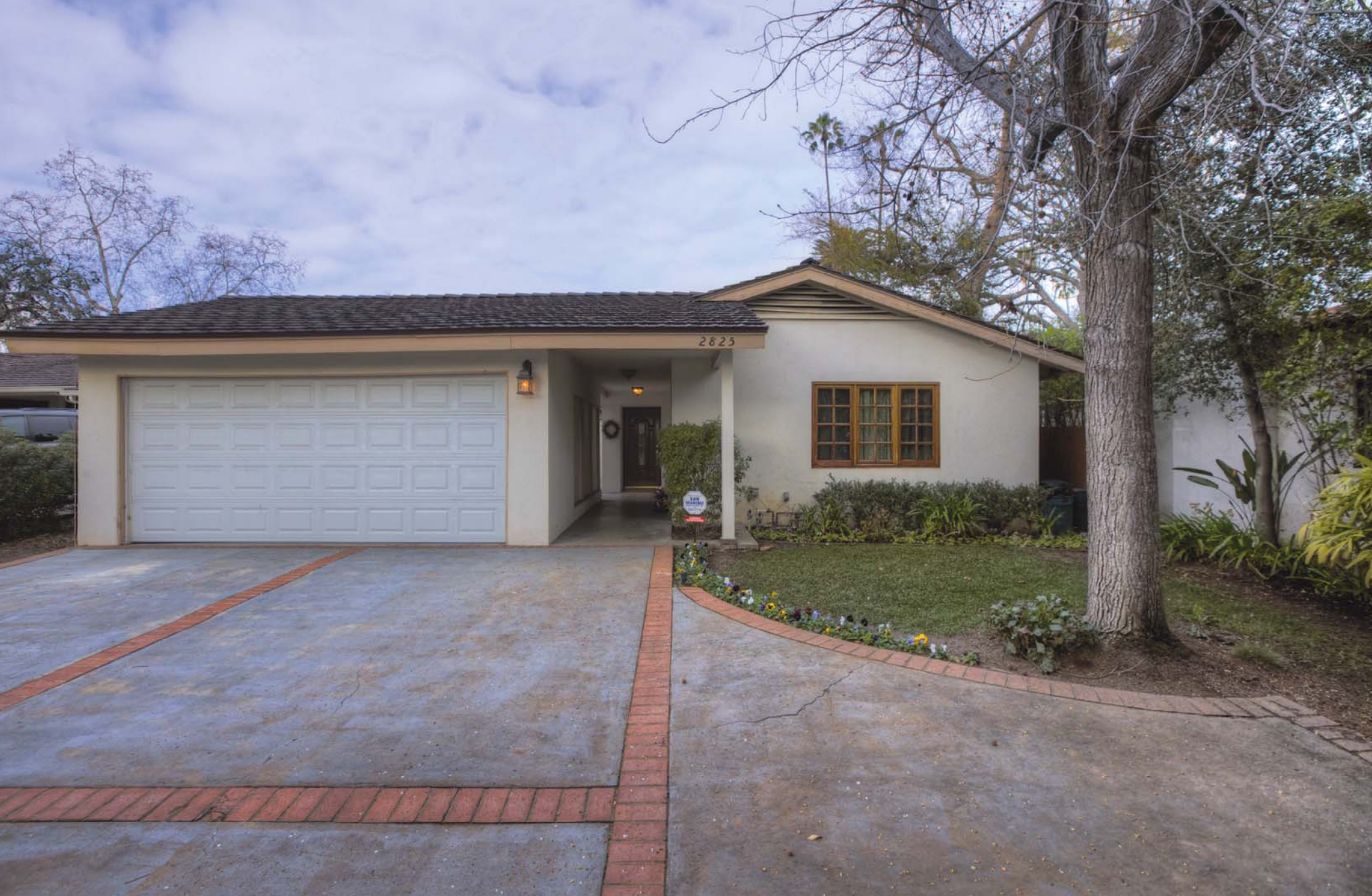
Immaculate Traditional in Desirable Mission District 2825 Monterey Road | San Marino