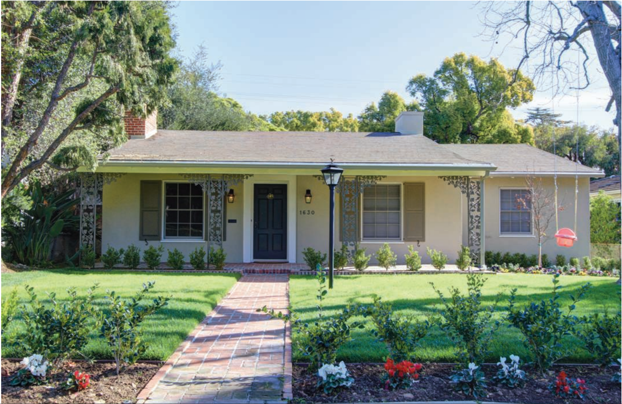
Storybook Traditional in Desirable Mission District 1630 Las Flores Avenue | San Marino