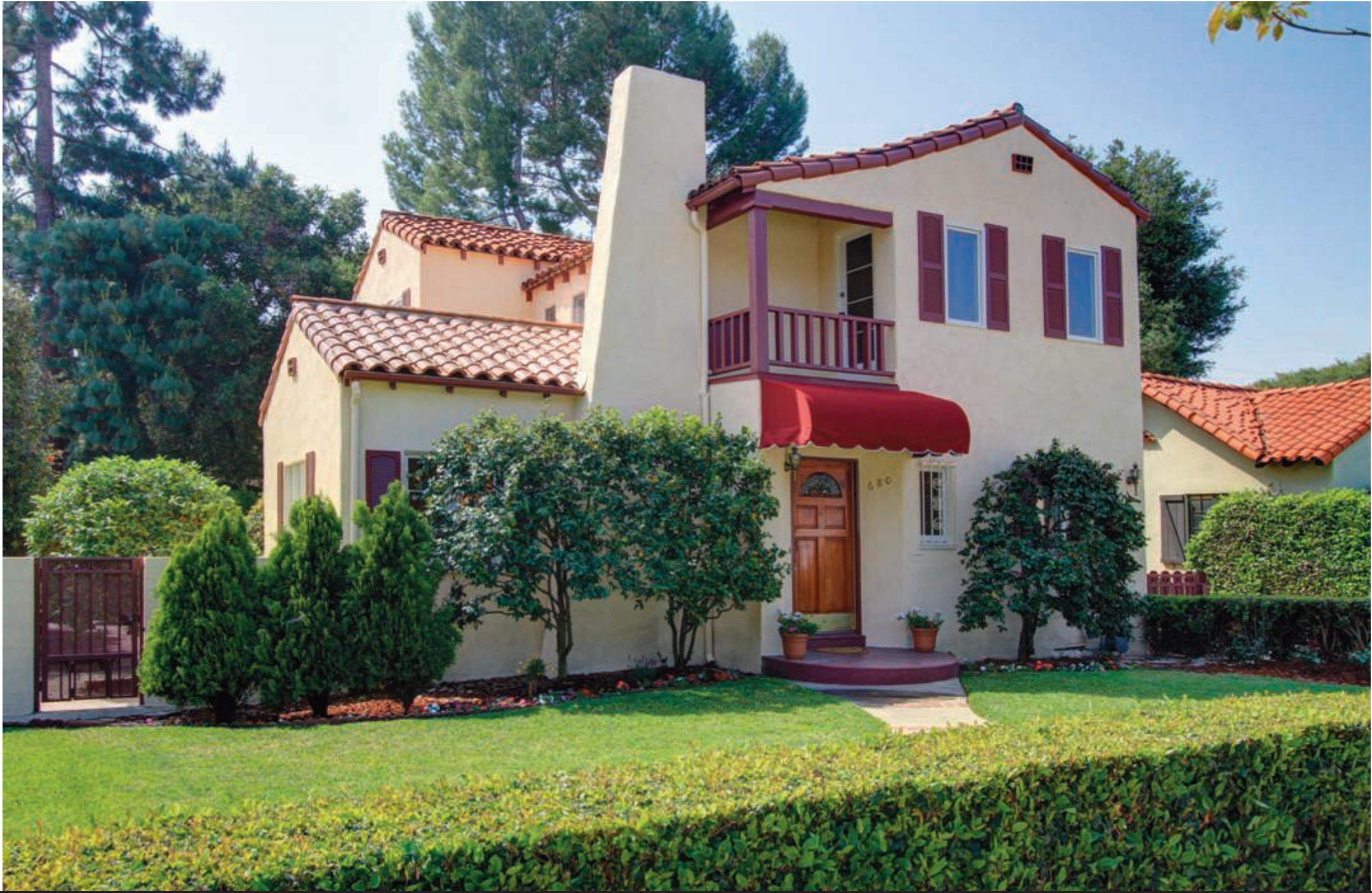
Charming 2 Story Spanish in Desirable Mission District 680 Plymouth Road | San Marino