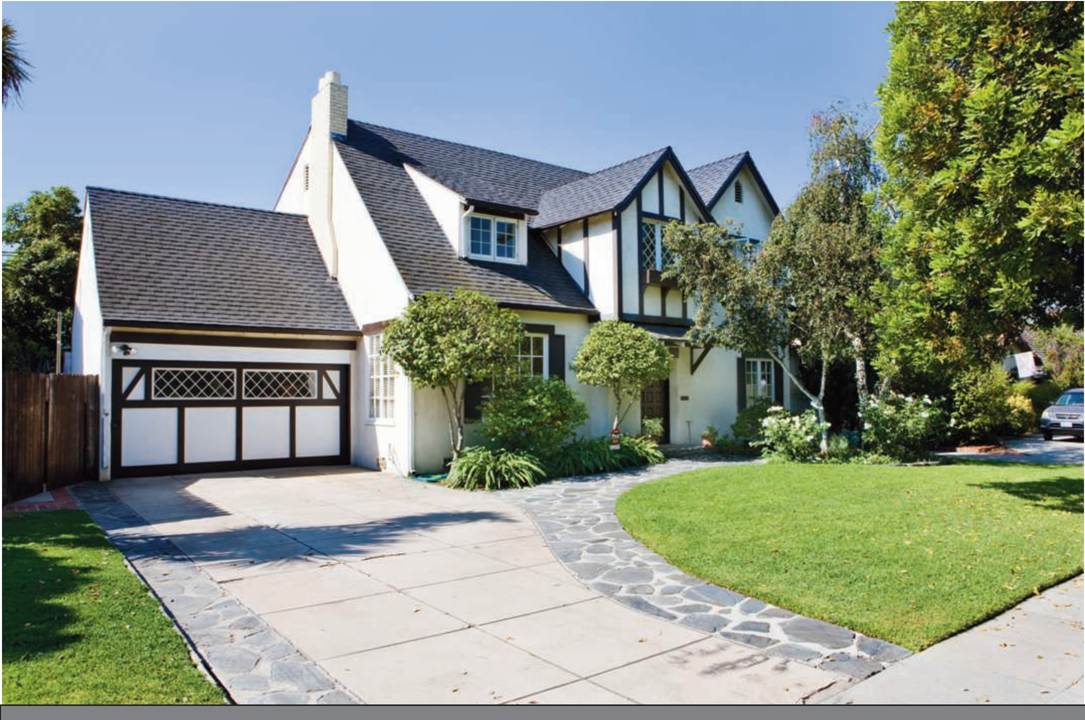
Storybook English in Desirable North San Gabriel 630 W. Roses Road | San Gabriel