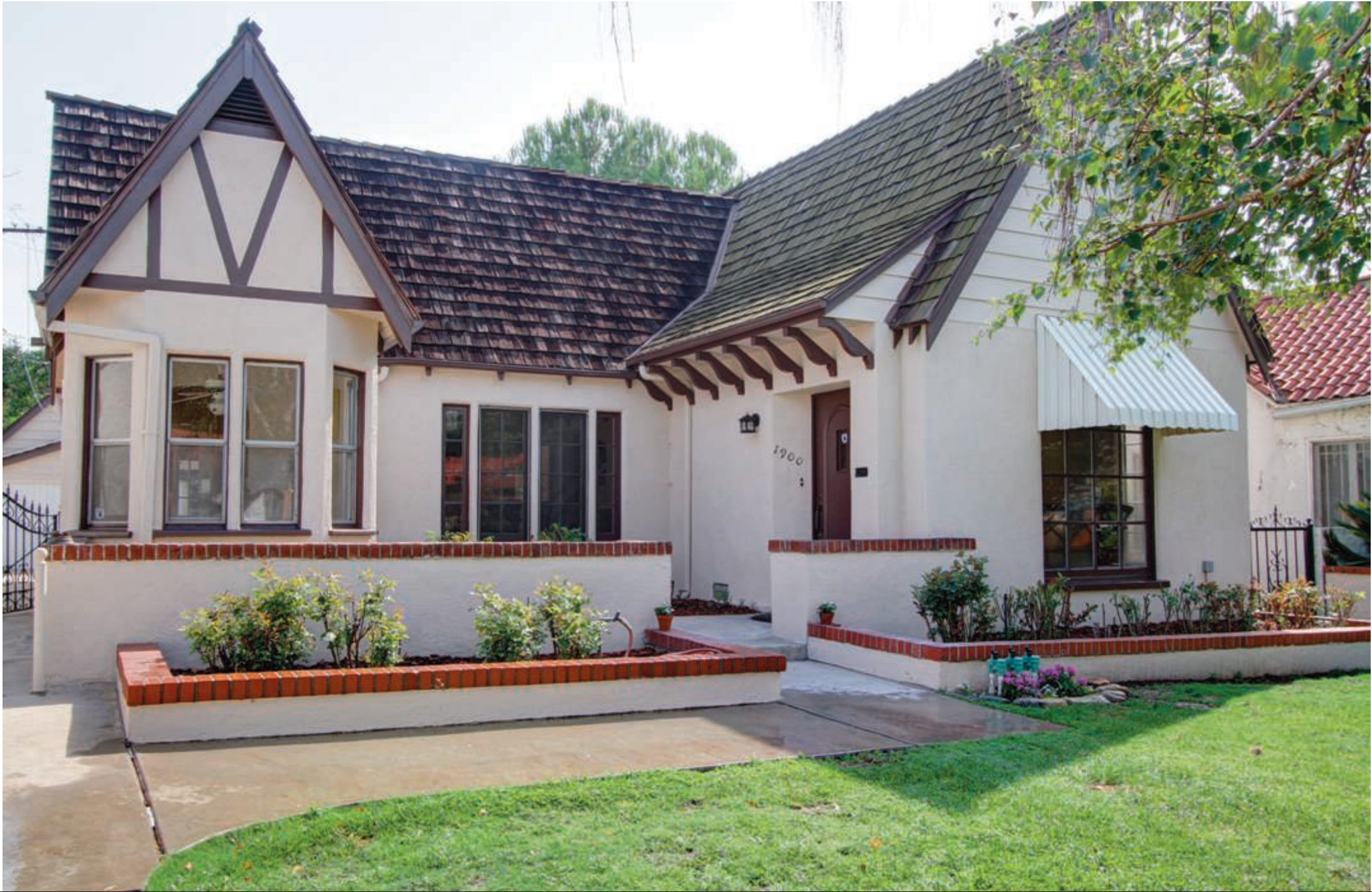
Charming English Tudor in Desirable Mission District 1900 S. Euclid Avenue | San Marino