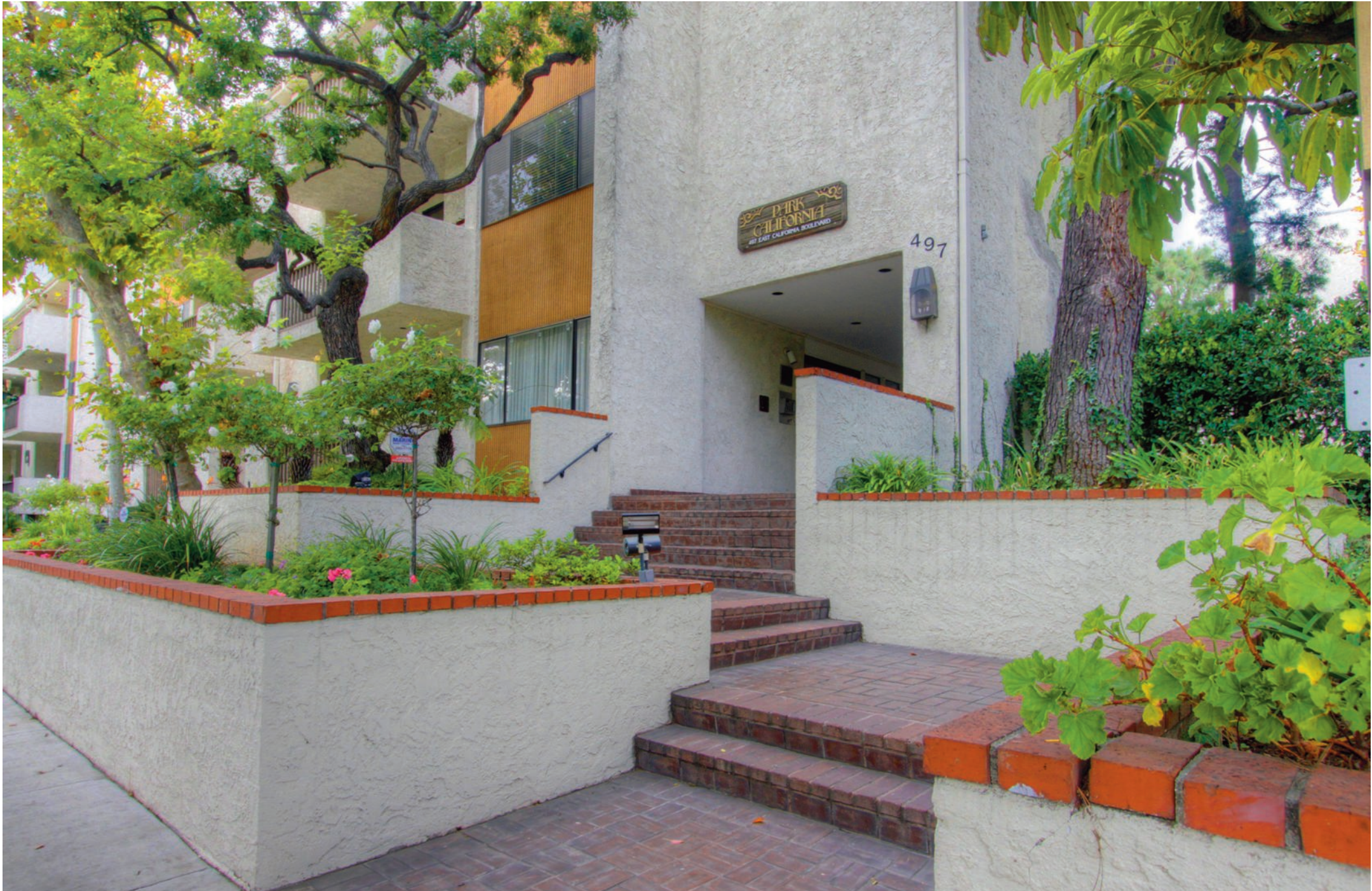
Pristine Upgraded Unit in Park California 497 E. California Blvd. #215 | Pasadena