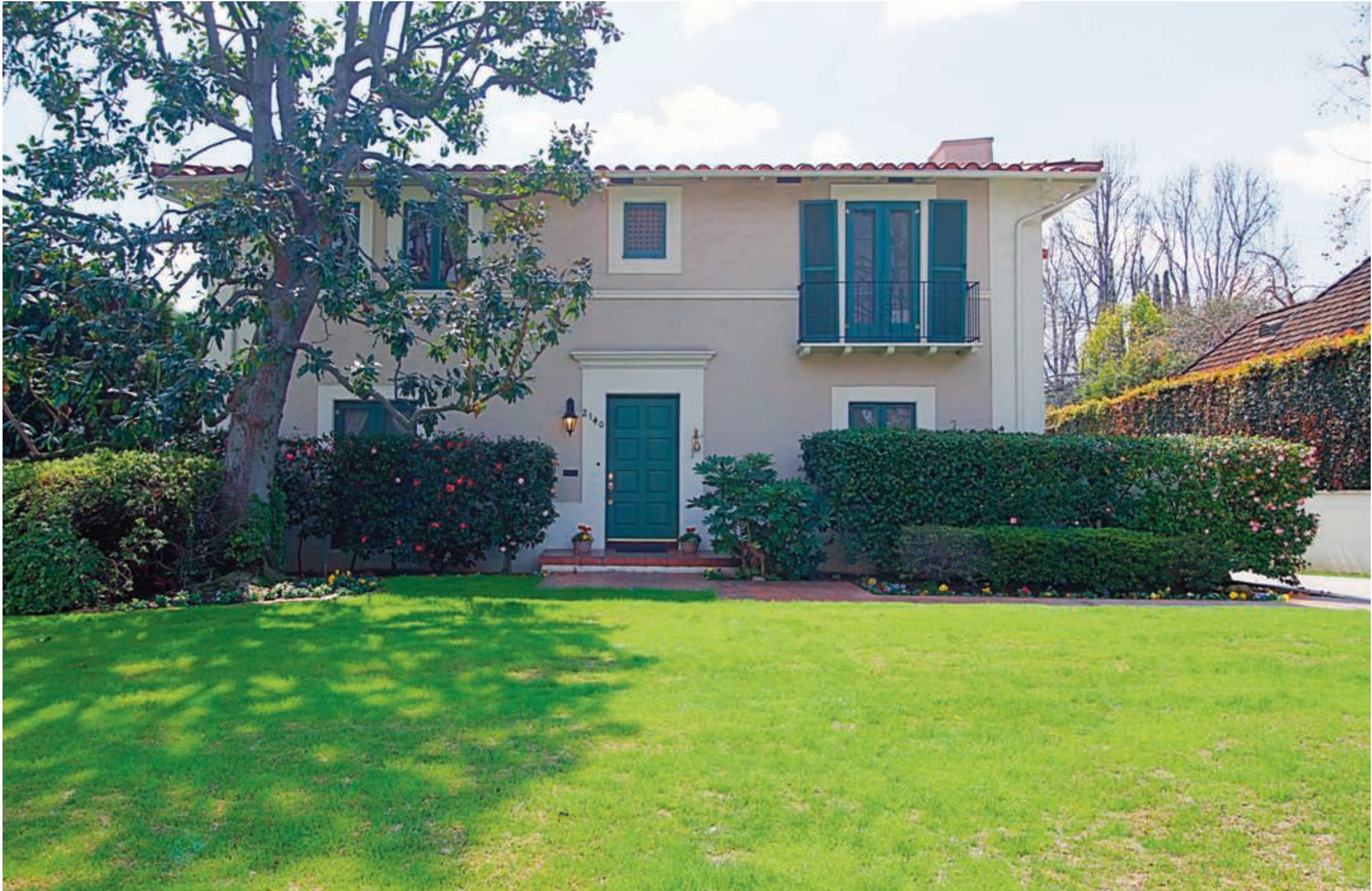
Exceptional Italian Mediterranean in North San Marino 2140 Homet Road | San Marino