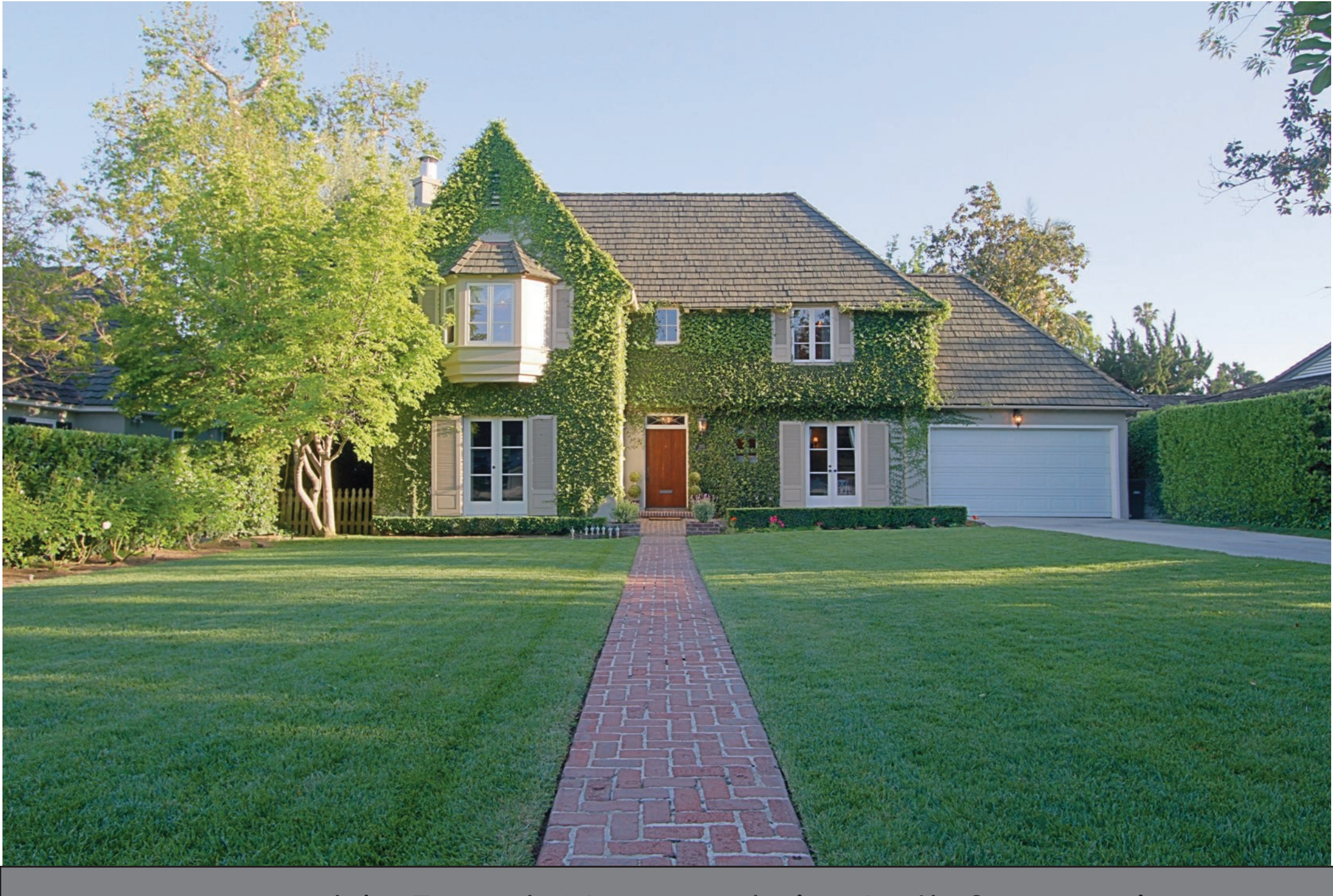
Impeccable French Normandy in North San Marino 2110 Homet Road | San Marino