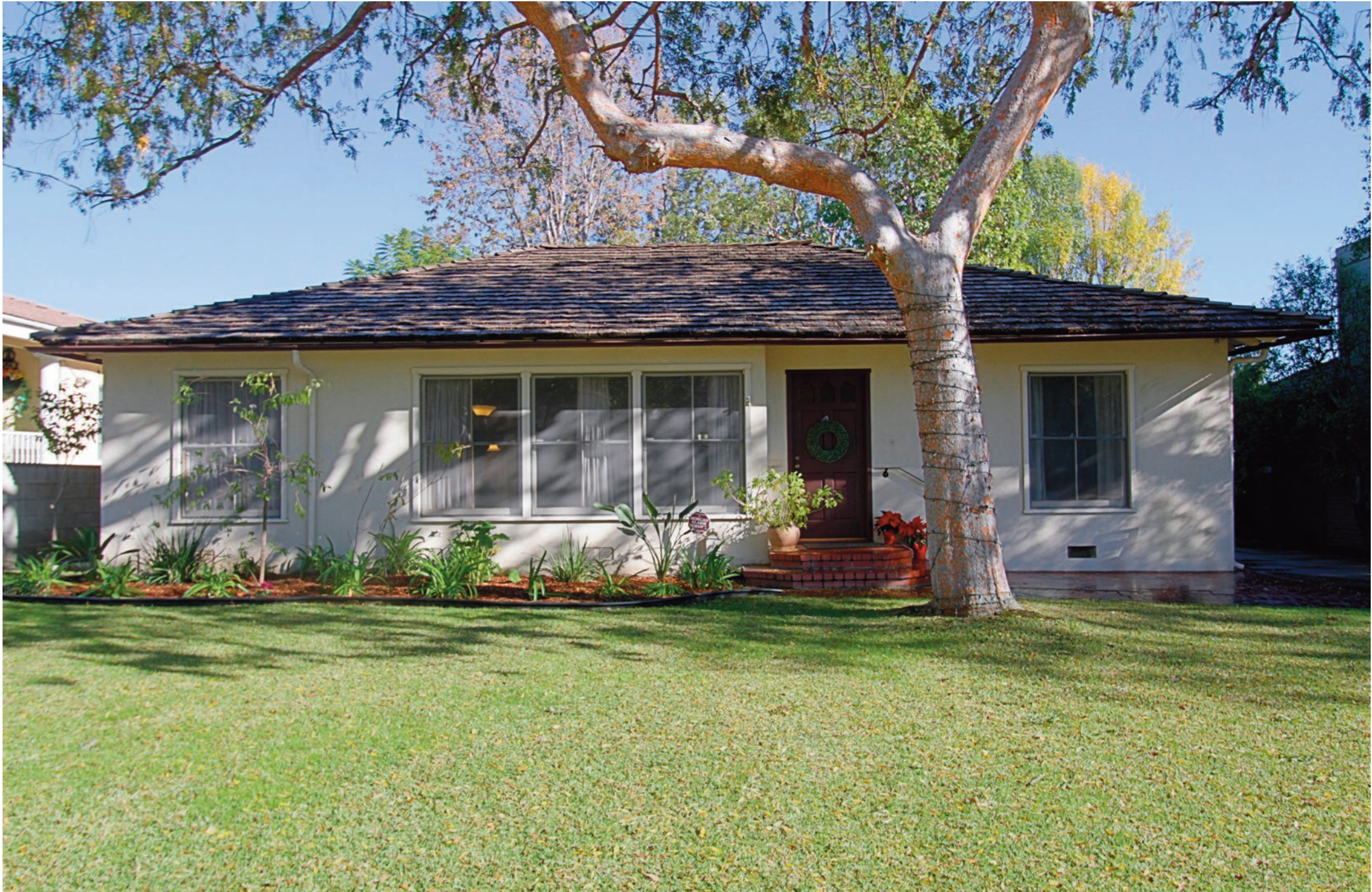
Classic Traditional on Quiet, Tree-lined Street in San Marino 1900 Sycamore Drive | San Marino