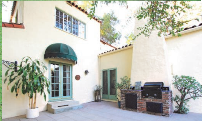
Gracious Spanish with Guest Quarters 1354 Garfield Avenue | San Marino